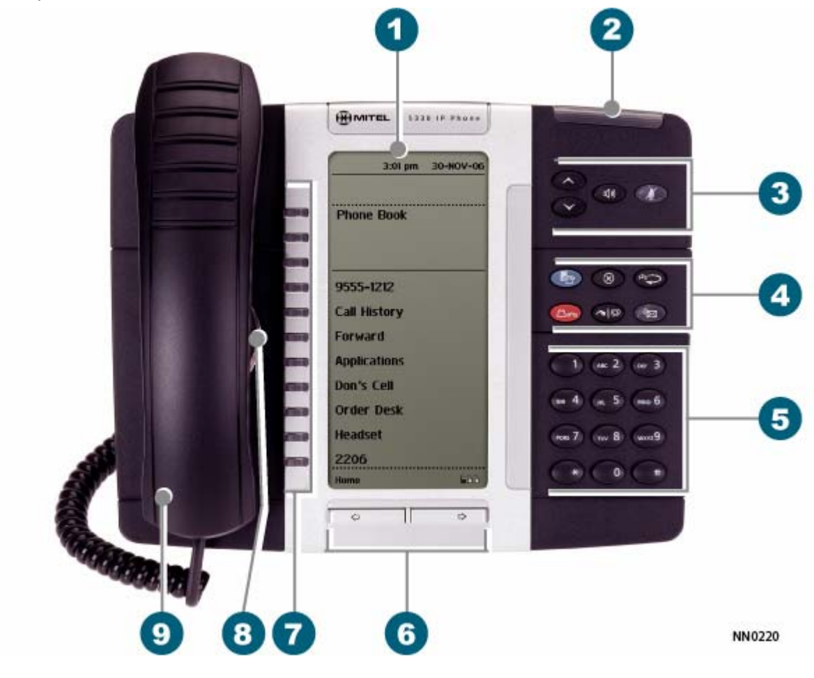
The 5330 IP Phone

The 5330 and 5340 IP Phones support Mitel Call Control (MiNet) protocol and session initiated protocols (SIP). Both phones support the Line Interface Module and 5310 IP Conference Unit. Additionally, they support Hot Desking and Clustered Hot Desking as well as Resiliency. The 5330/5340 phones are ideal for executives and managers, and can be used as an ACD Agent or Supervisor Phone, as well as a Teleworker Phone.